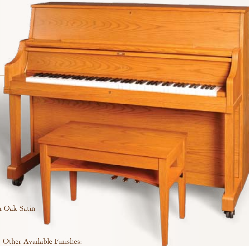
Shown in Oak Satin