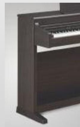
The traditional cabinet styling of the CN31 and CN41, with single piece wooden side panels.

The piano is often the centerpiece of any room it occupies. The exterior appeal of the instrument not only contributes to a room's decor, but also enhances the aesthetic appeal of playing and listening to the instrument. Considerable attention to detail is given to the cabinetry and finish of the CN Series instruments. Borrowing traditional design elements from more expensive digital and acoustic piano models, the CN Series provides a touch of elegance for player and listener alike.