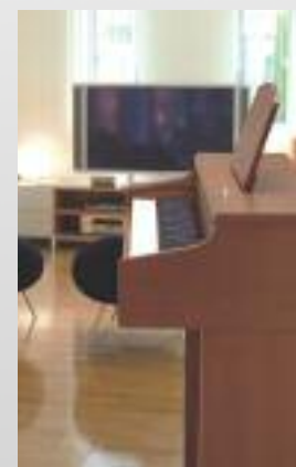
At just 16.5 inches (42.5 cm) deep, the surprisingly compact CN21 cabinet is an attractive addition to any area.