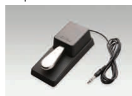
F-10 Damper Pedal