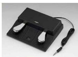
F-20 Double Pedal